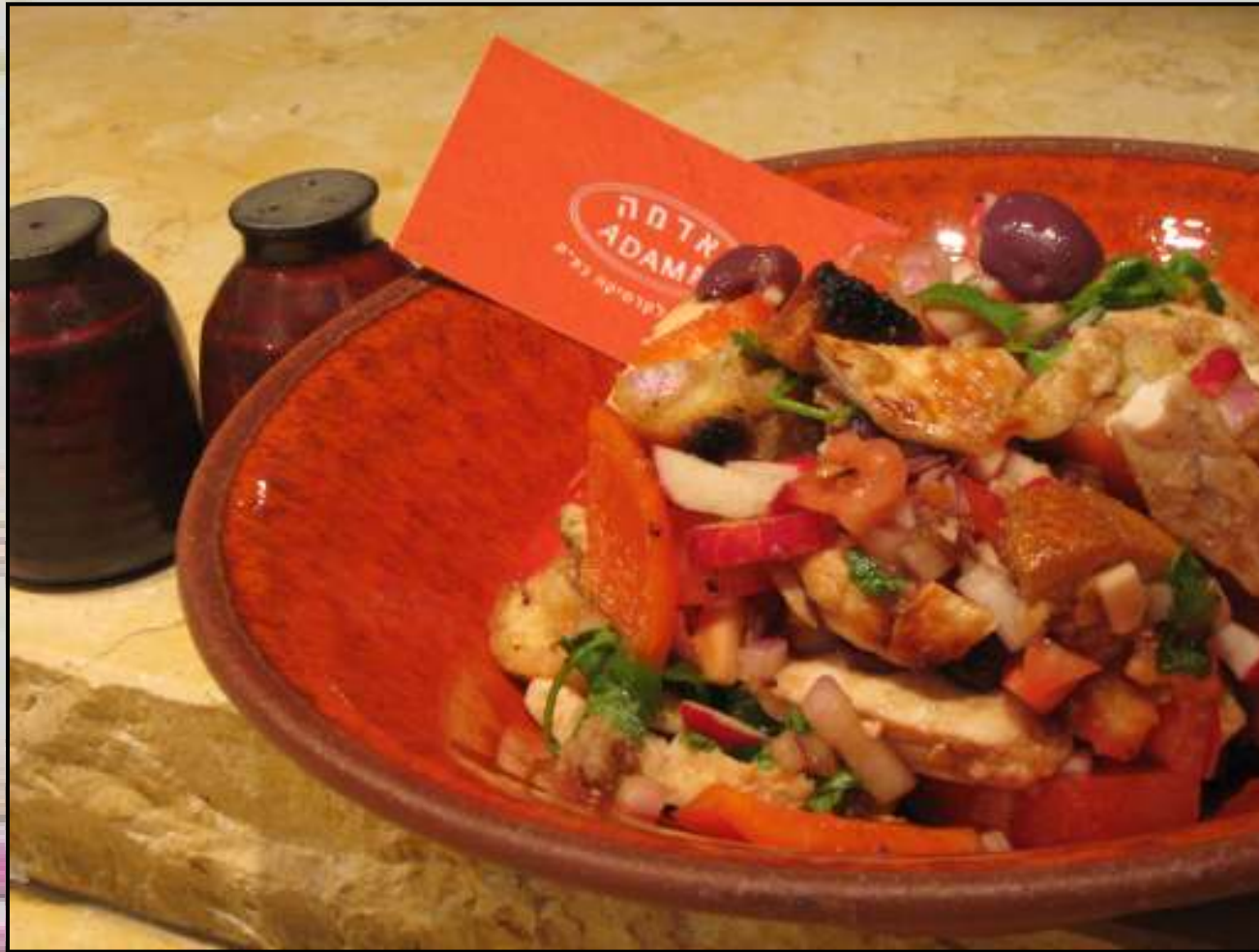
Italian Panzanella Salad – old bread salad The carnivores version Serves for 4